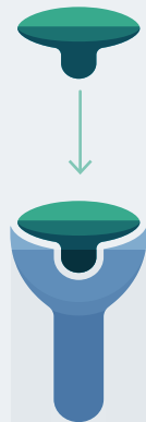
Full agonist: generates effect