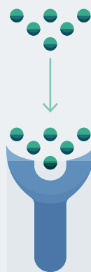
Partial agonist: generates limited effect